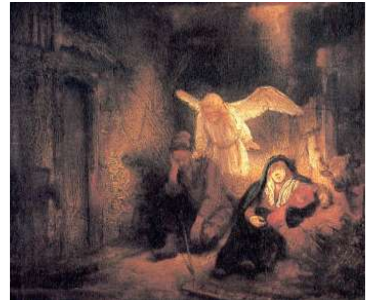
Rembrandt van Rijn's The Dream of St. Joseph , 1645.