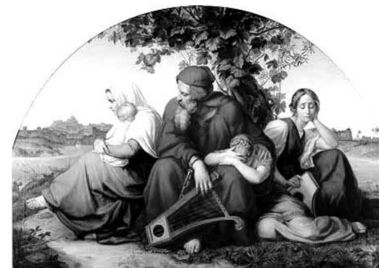
Eduard Bendemann "The Sorrowful Jews in Exile," 1832